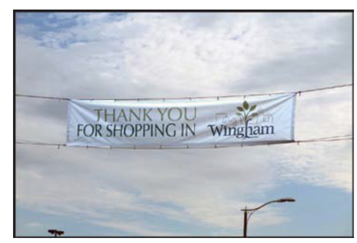
14oz Blockout mesh vinyl street banner SIDE 2