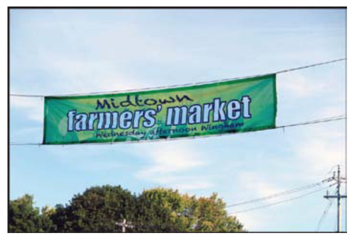
14oz Blockout mesh vinyl street banner SIDE 1