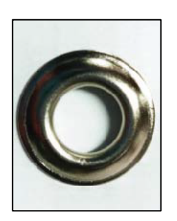
Grommets – Stainless Steel @ $0.58 each