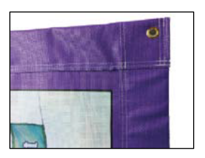
2" webbing throughout perimeter (over street banners etc.) @ $3.45 per linear foot of webbing