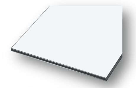
Solid PVC Core with 0.25" Aluminum Skin